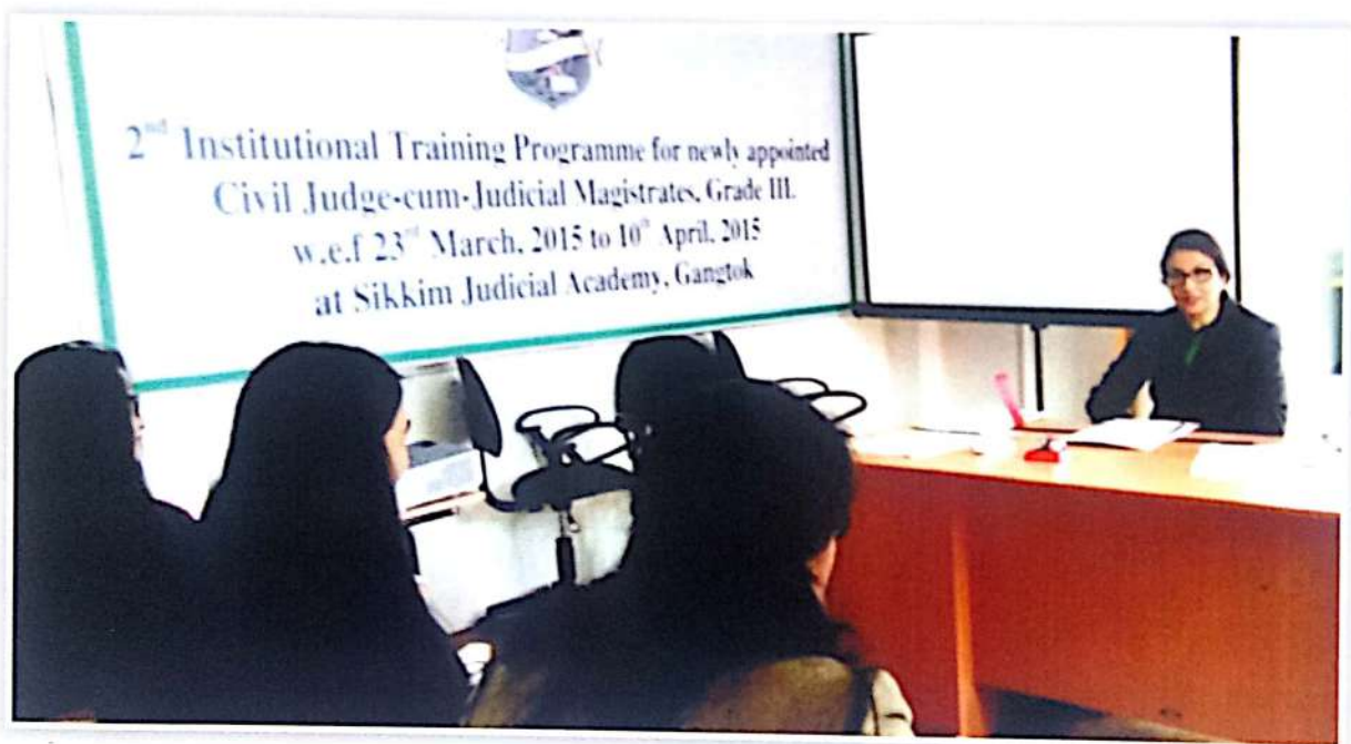
Hon'ble Smt. Justice Meenakshi Madan Rai, Judge, High Court of Sikkim imparting training to the newly appointed Civil Judges-cum-Judicial Magistrates, Grade III

The training programme also covered major topics such as Local Laws like Revenue Order No.1 dated 17 th May, 1917 (a) Notice no. 660/G dated 21 st May, 1931 (b) Notice no. 669/G dated 21 st May, 1931, The Sikkim Cultivators Protection Act, 1985, Sikkim Civil Courts Act, 1978, Sikkim Court Fee & Stamp on Documents Rules dated 30.03.1928 (Amended Schedule), Gangtok Rent Control & Eviction Act 1 of 1956 dated 31 st May, 1936, The Sikkim Anti Drugs Act, 2006, Sikkim States Rules Registration of Documents, 1930/Notification N.385/G dated 11 th April, 1928 (Regarding Registration of Documents), Notification no. 2947/G dated 22 nd November, 1946 (Regarding Registration of Documents), The Sikkim Regulation of Transfer of Land Act, 2005, The Sikkim Land (Requisition & Acquisition) Act, 1977 (1 of 1978), Work Permit for Foreigners in Sikkim-Notification no. 848/HP dated 10/12/1965, Sikkim Identification of Prisoners Rules, 2004, Sikkim State Legal Services Authority Rules, 1995