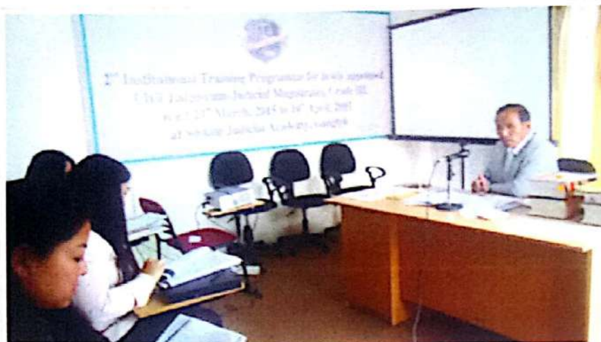
Hon'ble Shri Justice A.P. Subba, Former Judge, High Court of Sikkim imparting training to the newly appointed Civil Judges-cum- Judicial Magistrates, Grade III