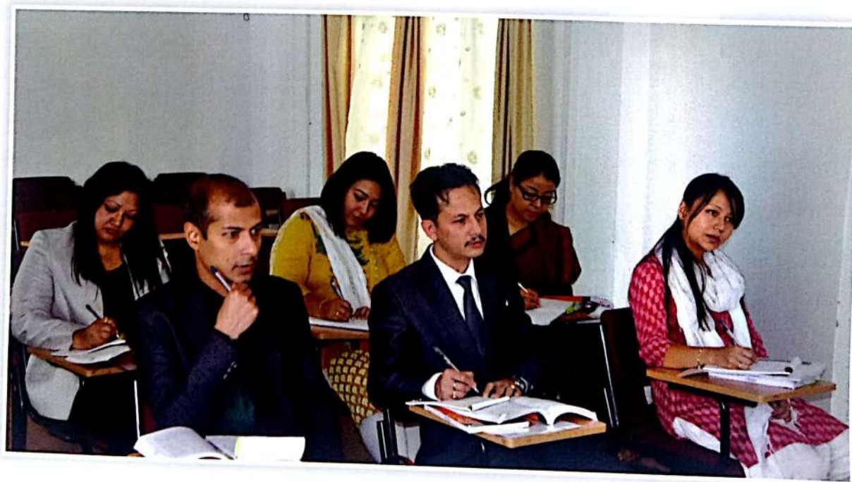
Judicial Magistrates of Sikkim

Judicial Magistrates from all the four Districts (East, West, North and South) were present in the programme.